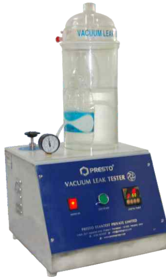
Model PVL - 0130 - PB

The Presto leak detector machine is a high quality packaging seal integrity tester that adds quality control measures to your packaging applications. Regardless of contents, the vacuum seal integrity test will help ensure that your packaged product is sealed to your specifications. Benefits of will be realized by many industries from package manufacturers and converters to end user packagers in the packaging of: Coffee, foiled cups, gels, Pouches, grains, cereal, bakery, namkeen, chips, Confectionery, snacks, pasta, frozen foods, cheese, pet food and treats, Medical and pharmaceutical , and many more.