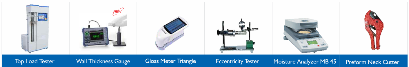
Top Load Tester